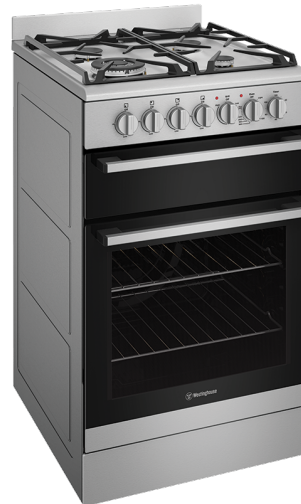
54cm Front Control Freestanding Cooker, Separate Grill WFE512SC, WFE542SC, WFE532WC